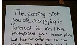
Awesomely Aggressive Windshield Notes You Should Totally Steal Sponsored | Gloriousa