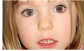
Missing Girl Thought To Be Found Alive In Rome Sponsored | Trend Chaser