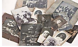
5 Reasons Why the New Ethnicity Test is a Game-Changer Sponsored | www.topbestdnatesting.com