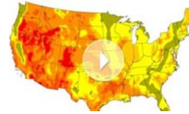
Incredible Map Reveals Energy Discovery That Spans Entire U.S. Sponsored | Banyan Hill Publishing