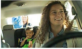
Interested in Grocery Pickup? Walmart Has the Answer Sponsored | Walmart