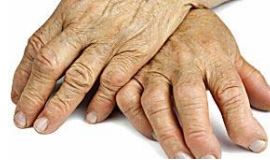
Here Are the Most Common Symptoms of Rheumatoid Arthritis Sponsored | Yahoo Search