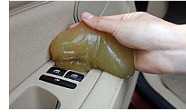
21 Car Cleaning Tricks You'll Wish You Knew Earlier Sponsored | Reader's Week